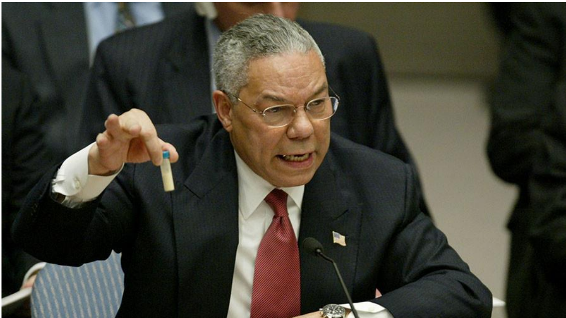
Colin Powell holds up a vial of Iraq WMD hoax.

The Rothschild KM decides to Mind-control the American masses to make it much easier to manipulate them into approving their illegal, Unconstitutional unprovoked, undeclared, unwinnable, perpetual wars needed to make huge profits and gain more world power: