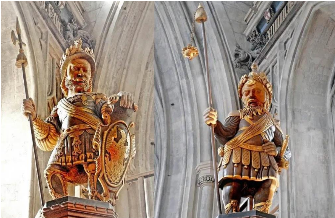
London's Gog and Magog.

Sadly MI-6, wanted this nuke detonated in order to gain more power for the Khazarian Mafia in England — their home base inside the City of London Financial District — since it has been losing power fast.