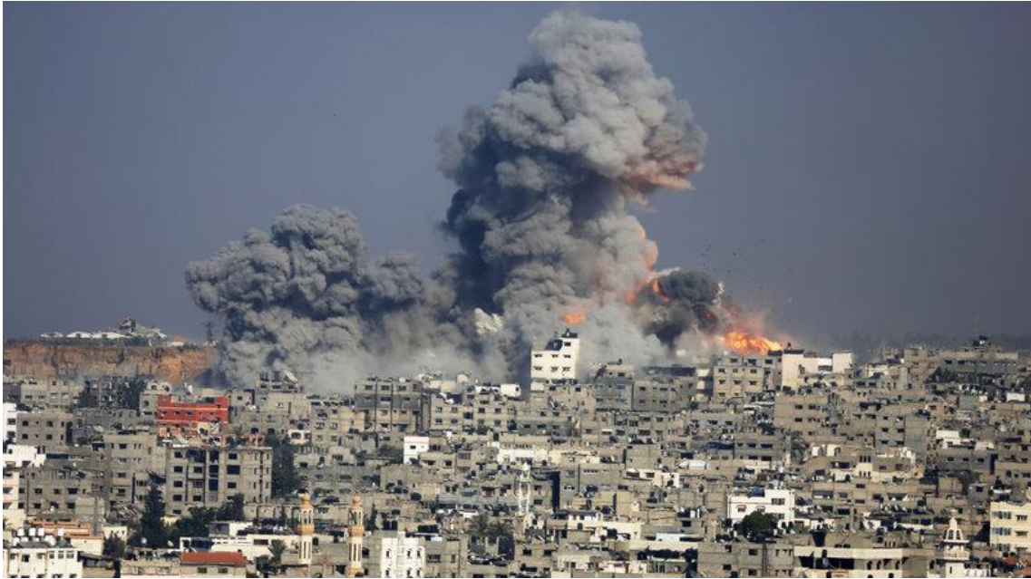
Israel bombing of the Gaza Strip.

Note: The history of the Khazarians, specifically the Khazarian Mafia (KM), the World's largest Organized Crime Syndicate that the Khazarian oligarchy morphed into by their deployment of Babylonian Money-Magick, has been nearly completely excised from the history books.