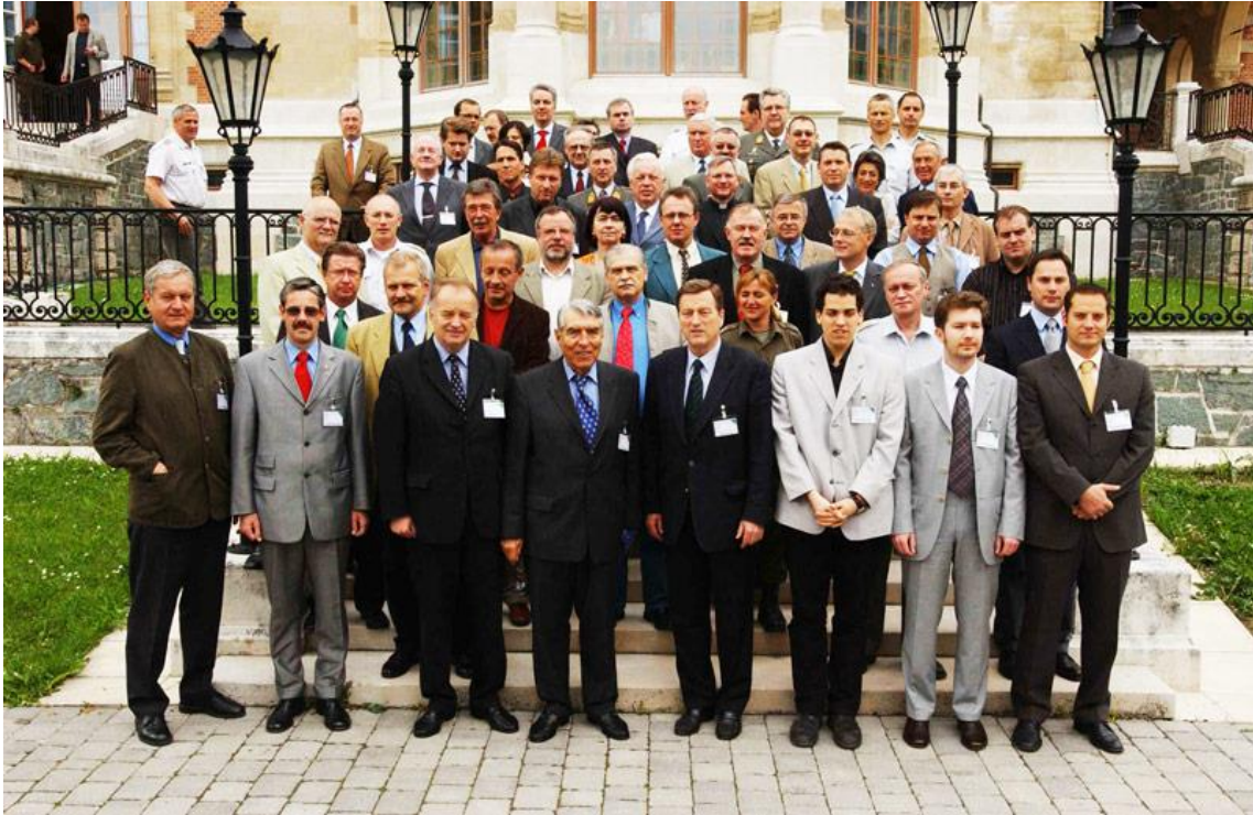
The Rothschild Kommission