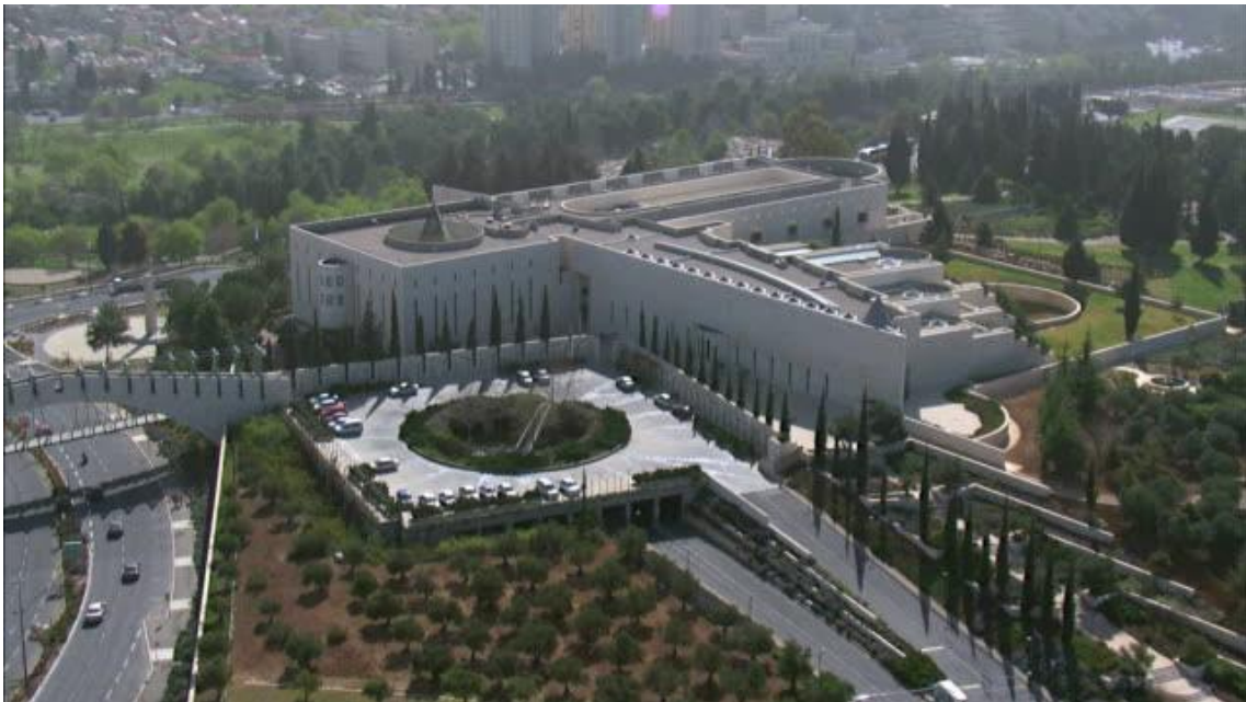
Freemasonry architecture was used in the building of the Knesset and the Israeli Supreme Court, viewed through windows.

Their financing of the Israeli Knesset and construction of it using Freemason occult architecture displayed their commitment to the occult and Babylonian Talmudism and all the evil accompanying it, including child sacrifice to their secret god Baal. They set up a NWO system called World Zionism which taught and inculcated susceptible Judaics with a paranoid group delusion of racial superiority, which assumed that all Gentiles were intent on mass-murdering all Judaics.