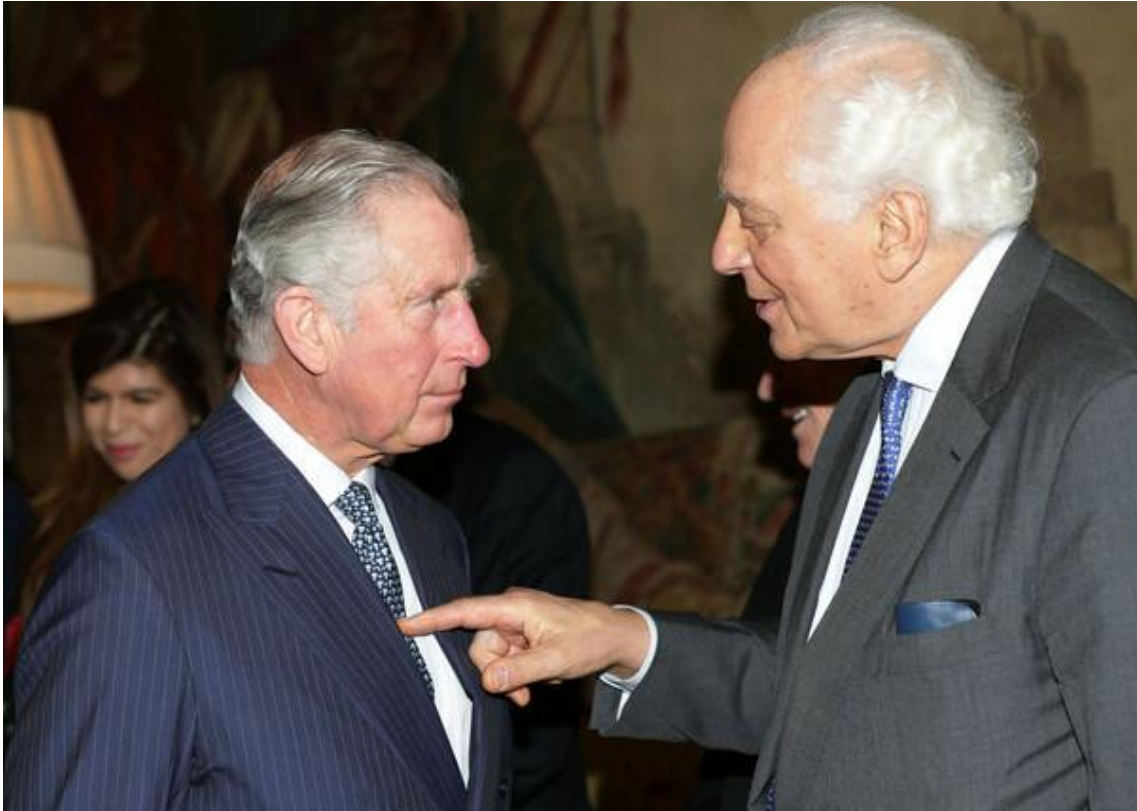
Evelyn de Rothschild poking his finger into Prince Charles.

The Khazarian Mafia (KM) decides to infiltrate and hijack all World Banking using Babylonian Black-Magick, also known as Babylonian Money-Magick or the secret art of making money from nothing also using the power of pernicious usury to accumulate interest: