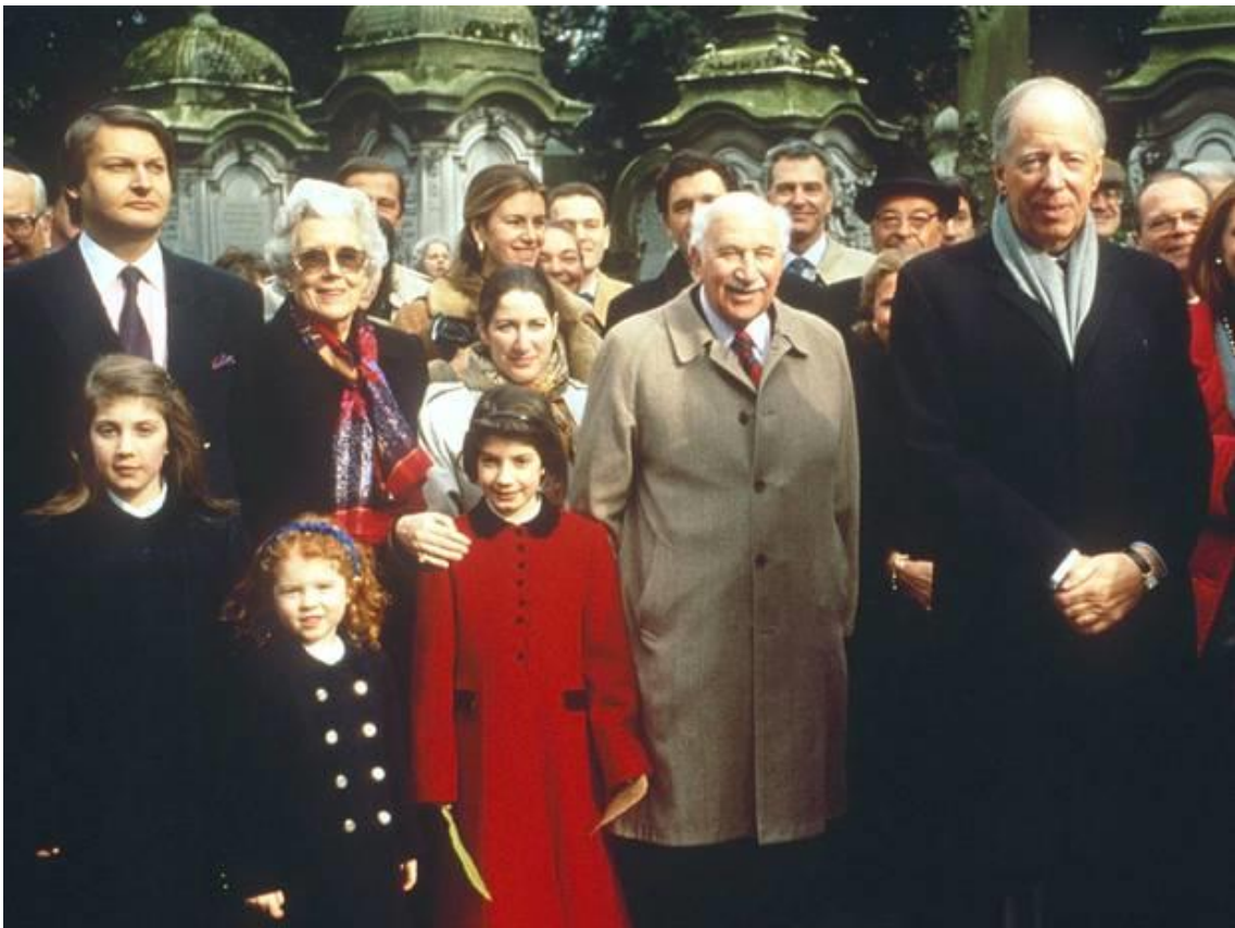
The Rothschild Family

Under this new system, they continue to infiltrate and hijack all American institutions, including the various American church systems, Freemasonry (especially the Scottish Rite and York Rite), the US military, US Intel, and most private defense contractors, the Judiciary and most agencies of the USG, including most State governments, and both major political parties as well.